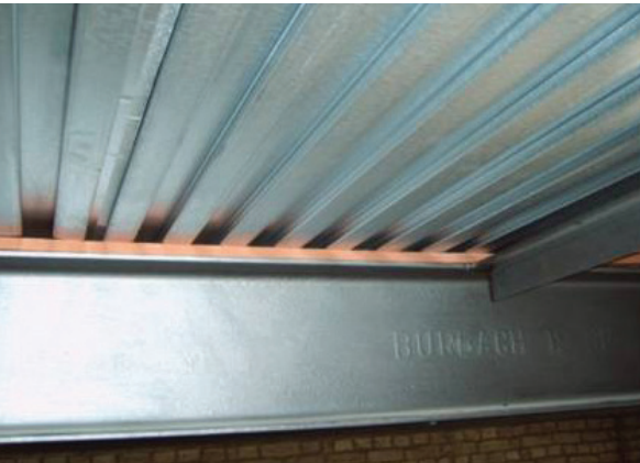
Regufoam for ceilings